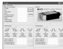
Fig. 2 Programming Software

The programming adapter is part of the programming kits CIS 680 and CIS 681 which contains i.a. a CD-ROM with the configuration software P-Set. All cables required for connecting the pressure switch have to be plugged to the programming adapter (included in scope of delivery). The user only requires a Windows® PC with serial interface (CIS 680) or USB-interface (CIS 681). Installing the configuration software P-Set is very easy. P-Set runs on all Windows® PC's (95, 98, ME, 2000, NT, XP).