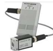
Fig. 3 Programming adapter