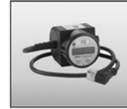
Fig. 4 Programming device P6